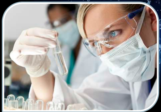
ULTRATHOR has been rigorously assessed by the independent APVMA

ULTRATHOR is water-based, odourless and will not leach through soil. It is not damaging to soil micro-organisms, earthworms or plants.