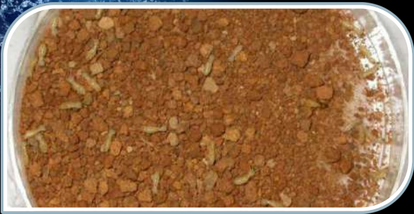
ULTRATHOR Soil Contact Study

The performance of the active constituent in ULTRATHOR has been proven around the world, in all types of conditions, and in the most difficult-to-control situations. Under Australian conditions, results have been outstanding. These results have also been confirmed in extensive laboratory studies where we can more directly observe the behaviour of the termites.